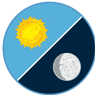
separated day and night